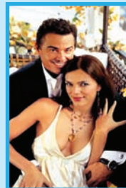
My Fair Brady (2005-2008) Rialto Square Theatre Christ Episcopal Church