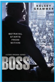
Boss (2011-2012) Joliet Diner