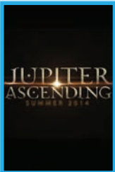
Jupiter Ascending (2014) 2001 Wildspring Parkway