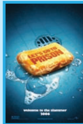
Let's Go to Prison (2006) Joliet Correctional Center