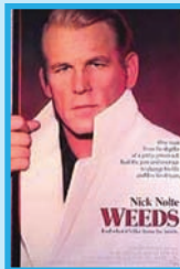
Weeds (1987) Joliet Correctional Center