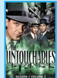
The Untouchables (1959-1963) Joliet Correctional Center

For more information, call 815-588-7940 or visit www.HeritageCorridorCVB.com