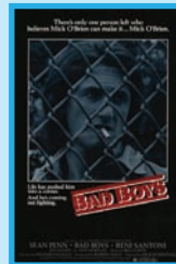
Bad Boys (1983) Joliet Correctional Center