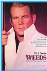
Weeds (1987) Joliet Correctional Center