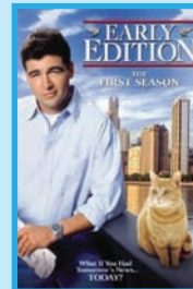
The Early Edition (1996-2000) Joliet Correctional Center