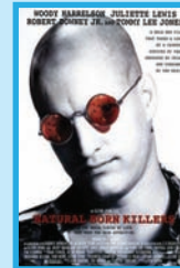
Natural Born Killers (1994) Stateville