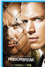
Prison Break (2005-2009) Joliet Correctional Center