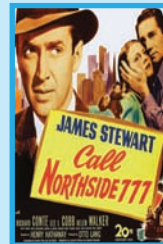
Call Northside 777 (1948) Joliet Correctional Center Stateville