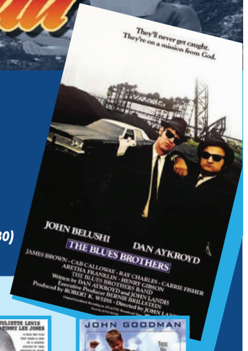
The Blues Brothers (1980) Joliet Correctional Center

Please refer to the map to find the locations, particularly the prisons, Joliet Correctional Center (1125 Collins St.), and Stateville Correctional Center (16830 S Broadway St.) and assorted spots throughout the downtown area.