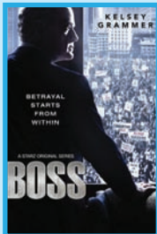
Boss (2011-2012) Joliet Diner