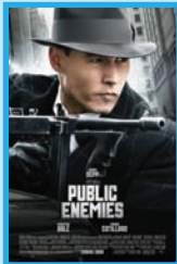
Public Enemies (2009) Joliet Correctional Center Stateville