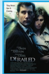
Derailed (2005) Joliet Correctional Center