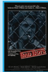
Bad Boys (1983) Joliet Correctional Center