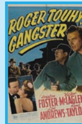
Roger Touhy, Gangster (1944) Joliet Correctional Center