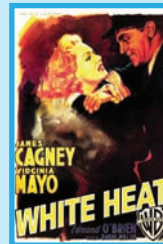
White Heat (1949) Joliet Correctional Center