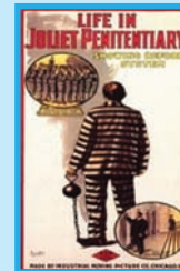
Joliet Prison (1914) Joliet Correctional Center